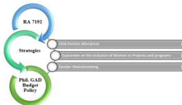
Figure 2. Development of the Philippine GAD Budget Policy

With these international and local policies set, a manifest of each state’s perception on gender-responsive budgeting and allocations on related programs have been scrutinized by the respective nations.